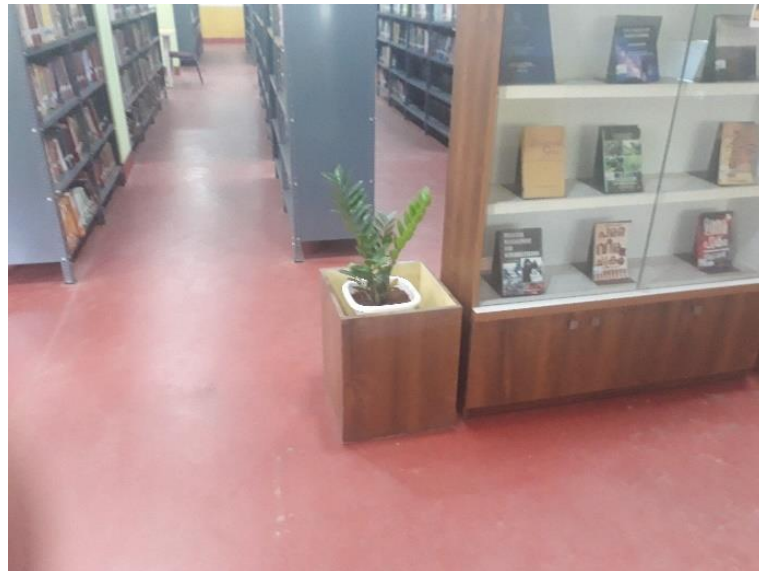
Indoor Plants set in the Library