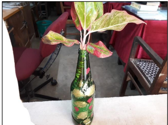
Bottle Art with Plants set in various departments