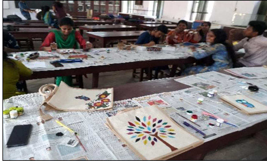
Jute bag designing Competition