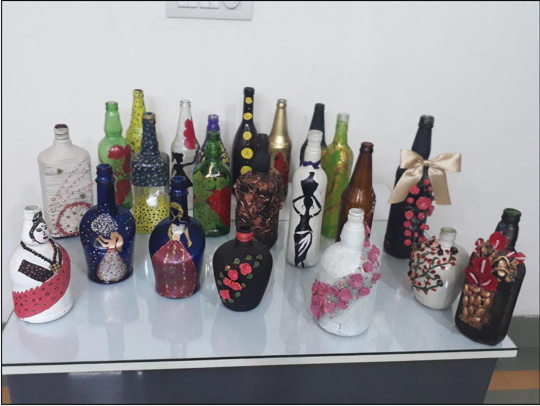
Lockdown Value time by the Co-ordinator